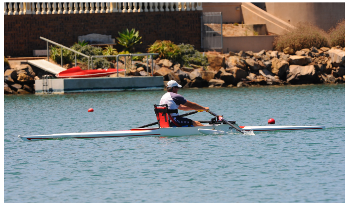
Above: Para Rowing