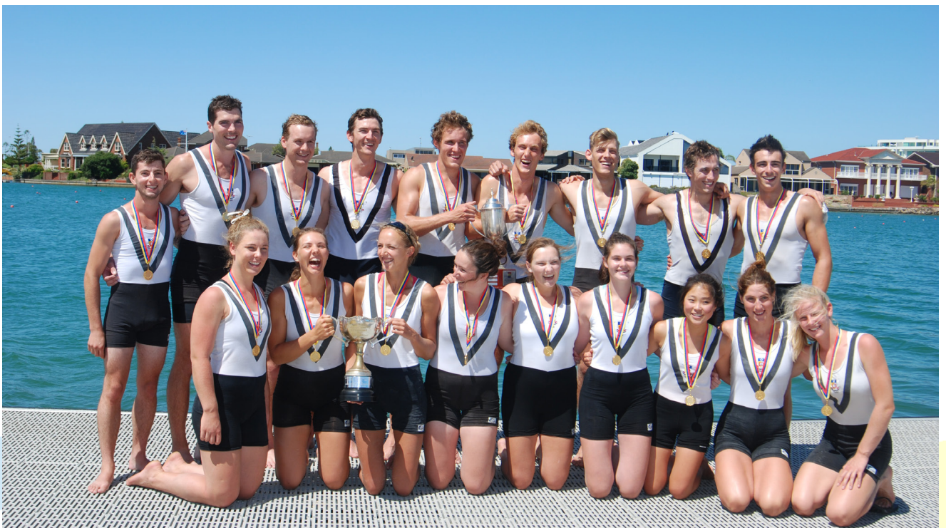
1 st Grade State Championships Winning 1 st Grade Men's and Women's VIII Adelaide University Boat Club