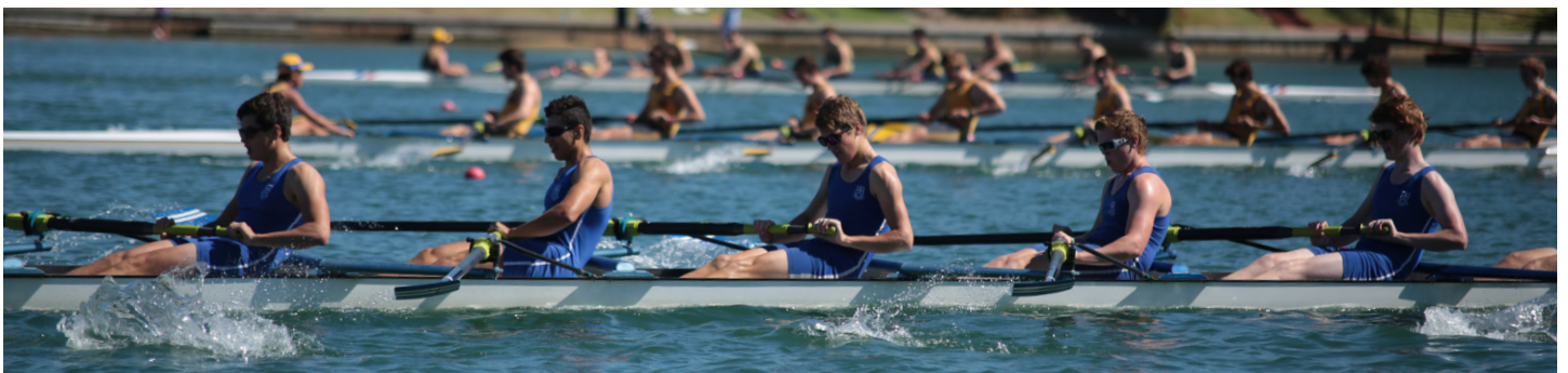
Above: School's Head of the River 2013 - Boy's 1 st VIII

I would like to finish up by thanking all the host clubs and schools for their efforts this season and extend a thank you to all the volunteers who worked behind the scenes before, during and after regattas, and the Boat Race Officials for their tireless efforts week in and week out.