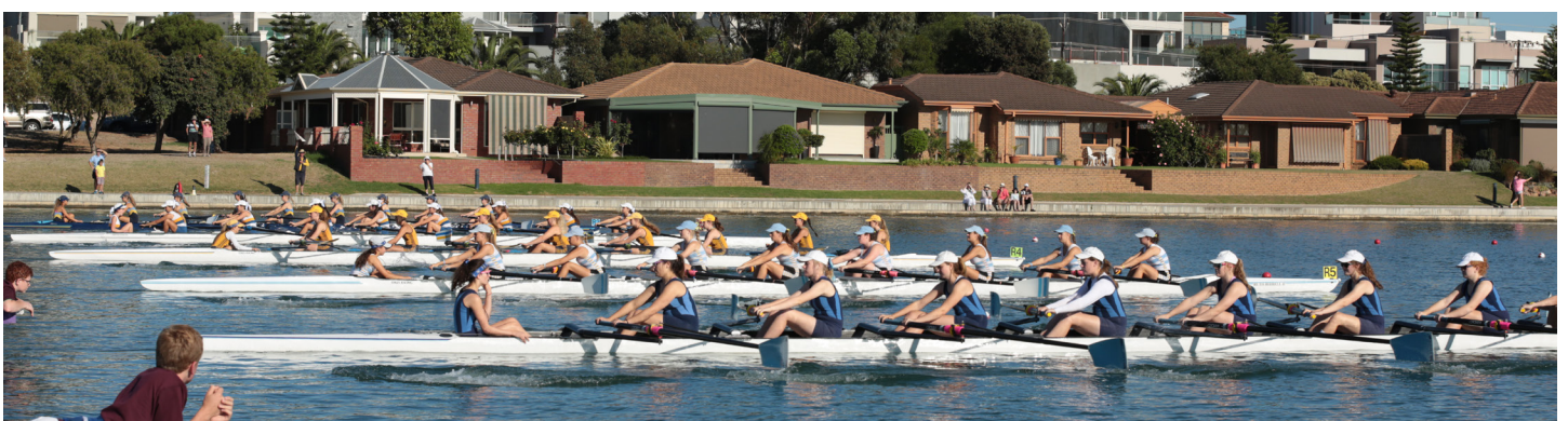
Below: School's Head of the River 2013 - Girl's 1 st VIII