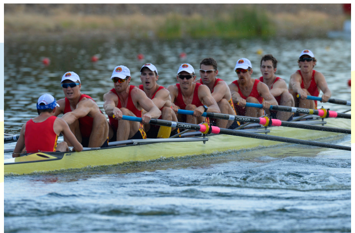
Below: SA Kings Cup VIII