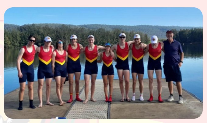
Place: 1st (B-Final)