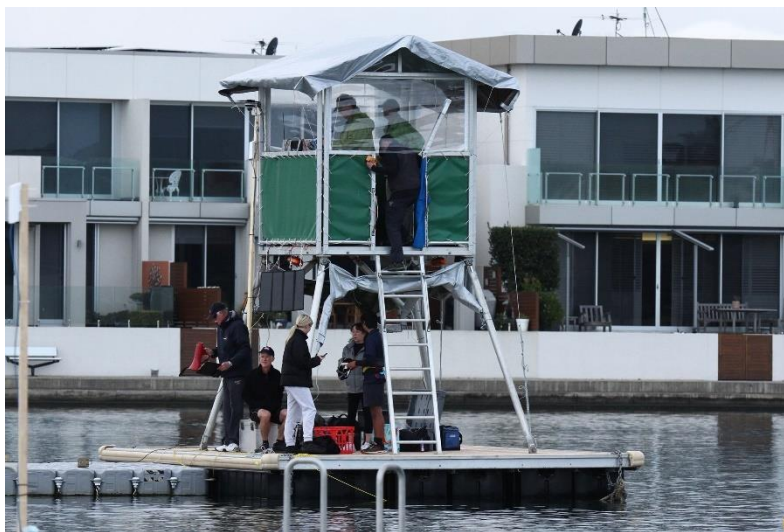
Start Tower, World CUP 3 Simulation Regatta, West Lakes 2021.