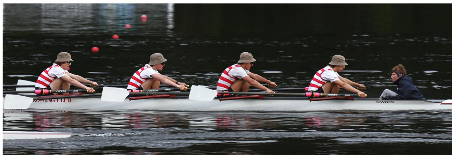
Torrens Rowing Club U17M4x+: National Championships 2021, Lake Barrington.