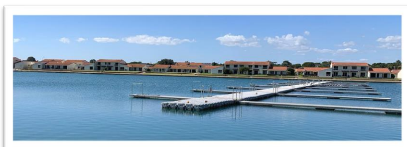
Start Pontoon, West Lakes.