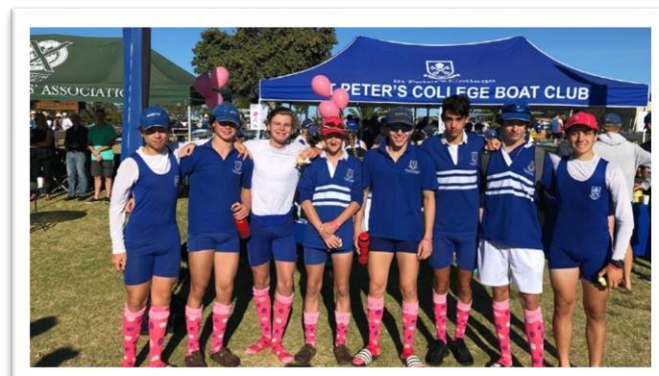
St Peter's College Rowers, West Lakes Regatta, February 2021.