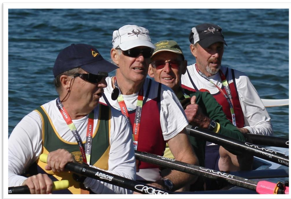
Pembroke Masters Composite 4x+, Masters National Championships, West Lakes.