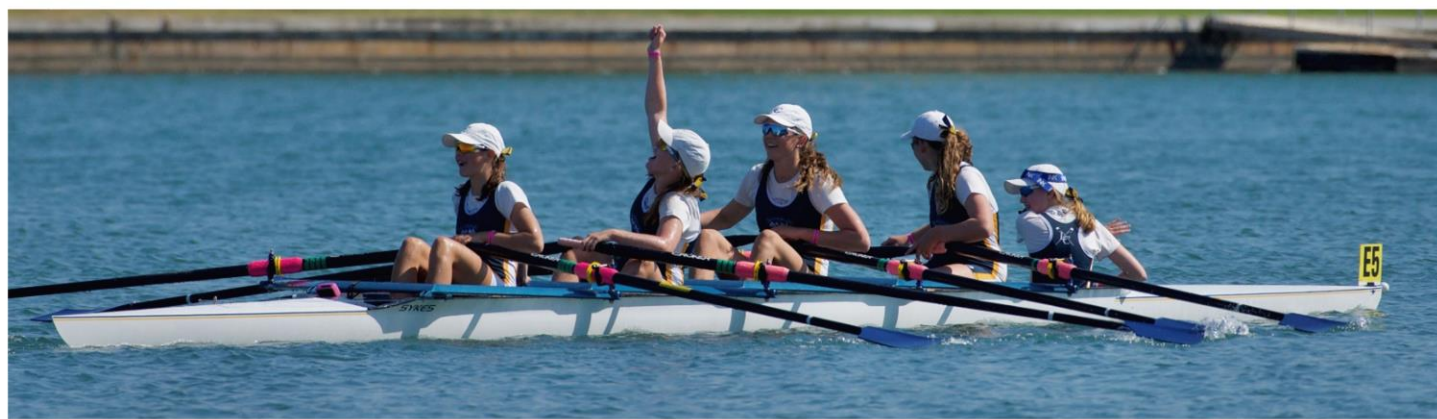
Loreto College Yr 9/10 A 4x+, West Lakes.