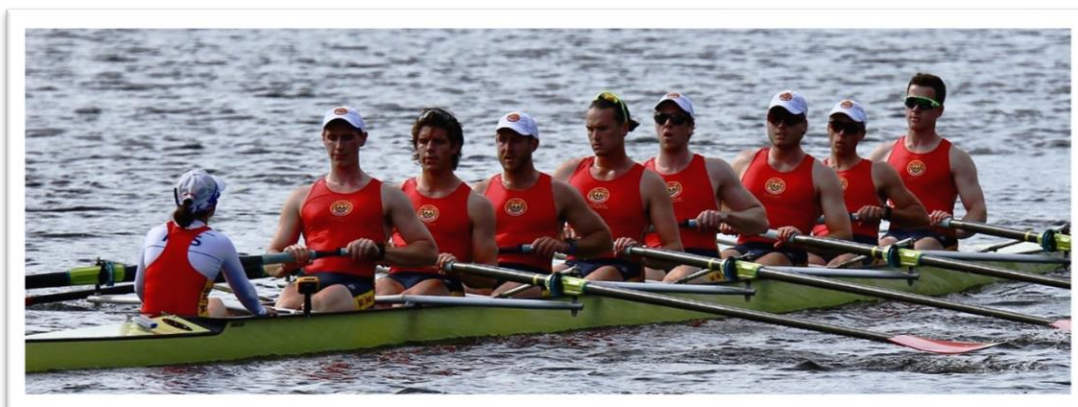
SA Kings Cup Crew, National Championships 2021, Lake Barrington.