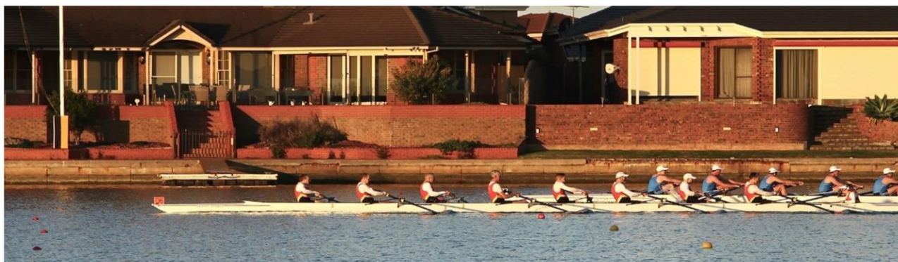
South Australian Masters Men's 8+. Masters National Championships 2021, West Lakes.