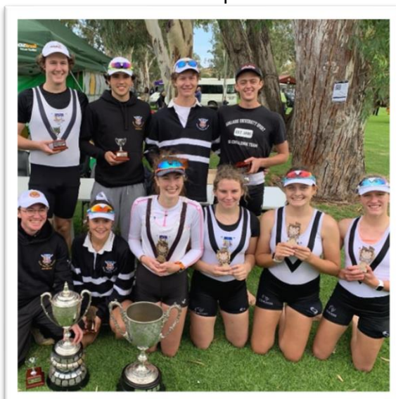
AUBC Rowers, Mannum Regatta 2021.