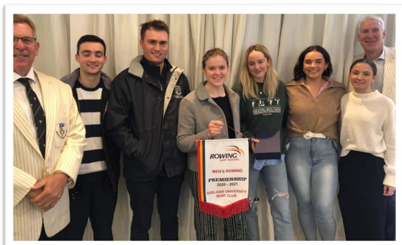
Rowing SA Awards Breakfast 2021, Lakes Hotel.