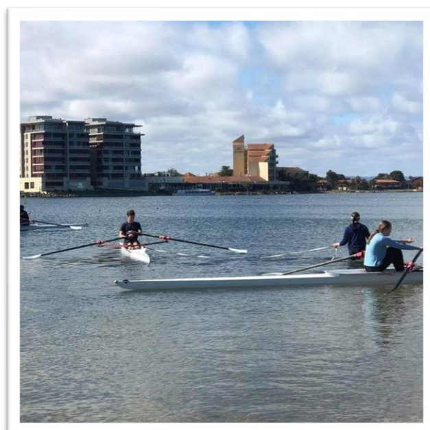
TID Learn to Row Program, 2020.

Development & Communications Coordinator August 2021