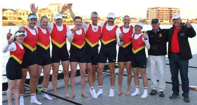
SA Masters Men's 8+, Masters National Championships, 2021. West Lakes.