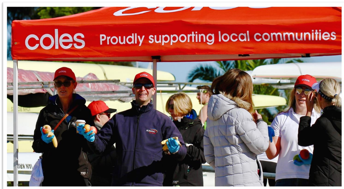
Masters National Championships 2021, West Lakes.