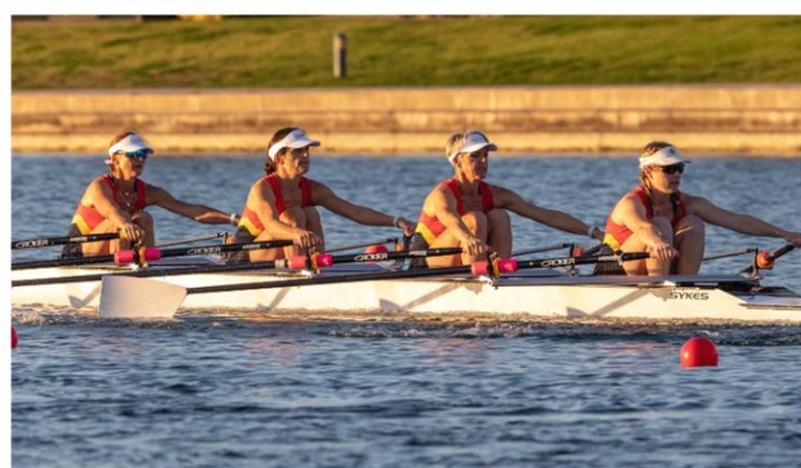
SA Masters Women's 4x, Masters National Championships, 2021. West Lakes.