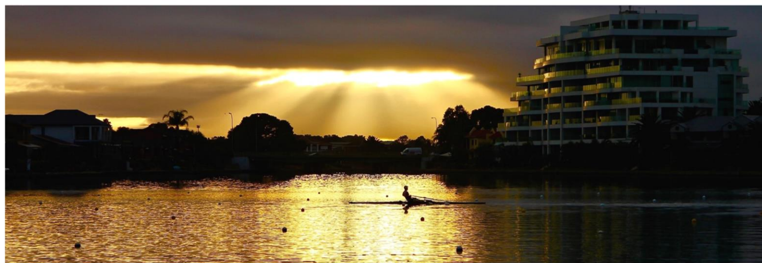
Masters National Championships 2021, West Lakes.