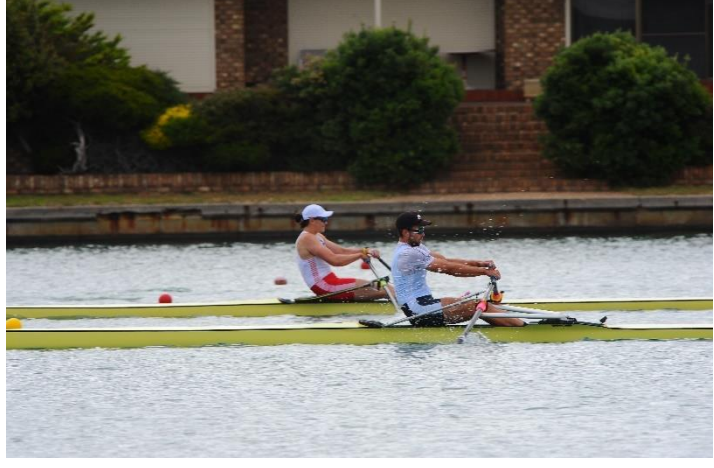
Kings Cup Small Boat Racing, SA Selection Trials, December 2019