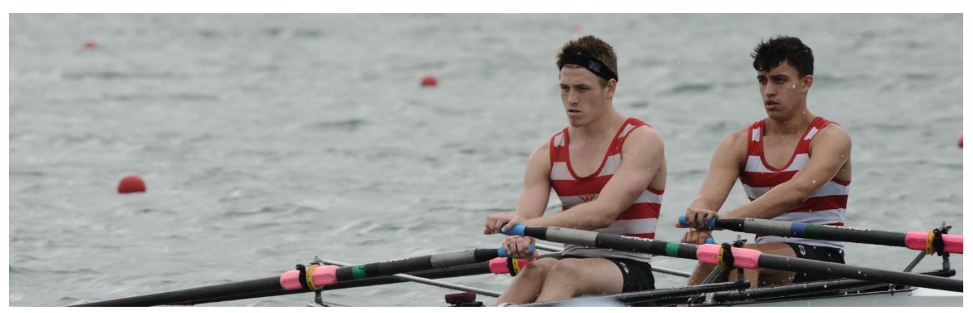
TRC OM2x, PAC West Lakes Regatta, 2020

Three of the four family members are involved in recreational rowing. Philip looks forward to building the strength of Rowing SA to support everyone participating in rowing in South Australia.