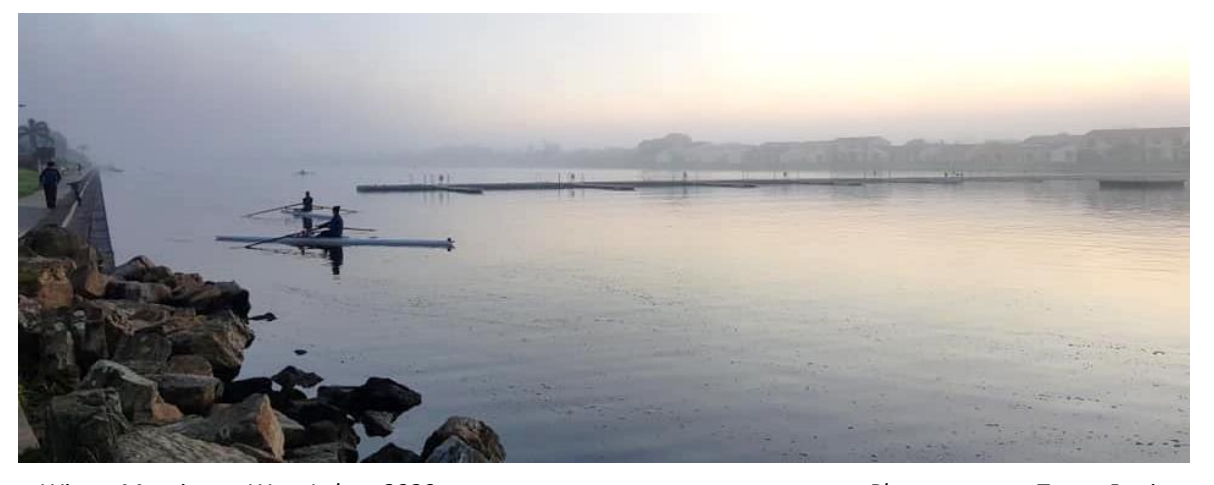
Winter Morning at West Lakes, 2020