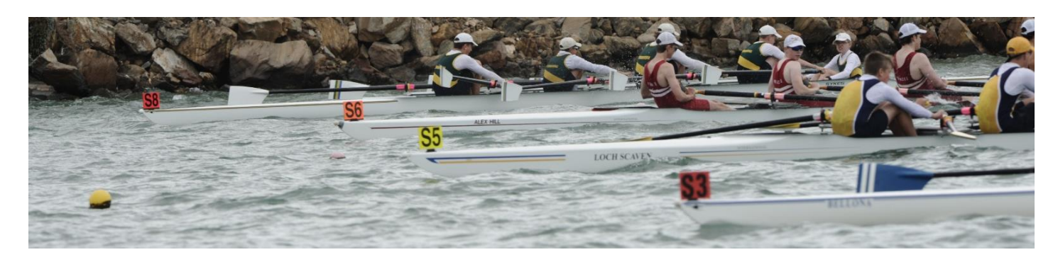
SB Yr 8/9 4x+ final, PAC West Lakes Regatta, 2020