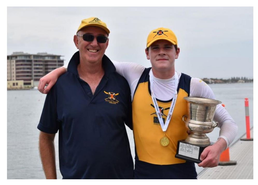
U17M1x medal presentation, SA State Championships, 2020