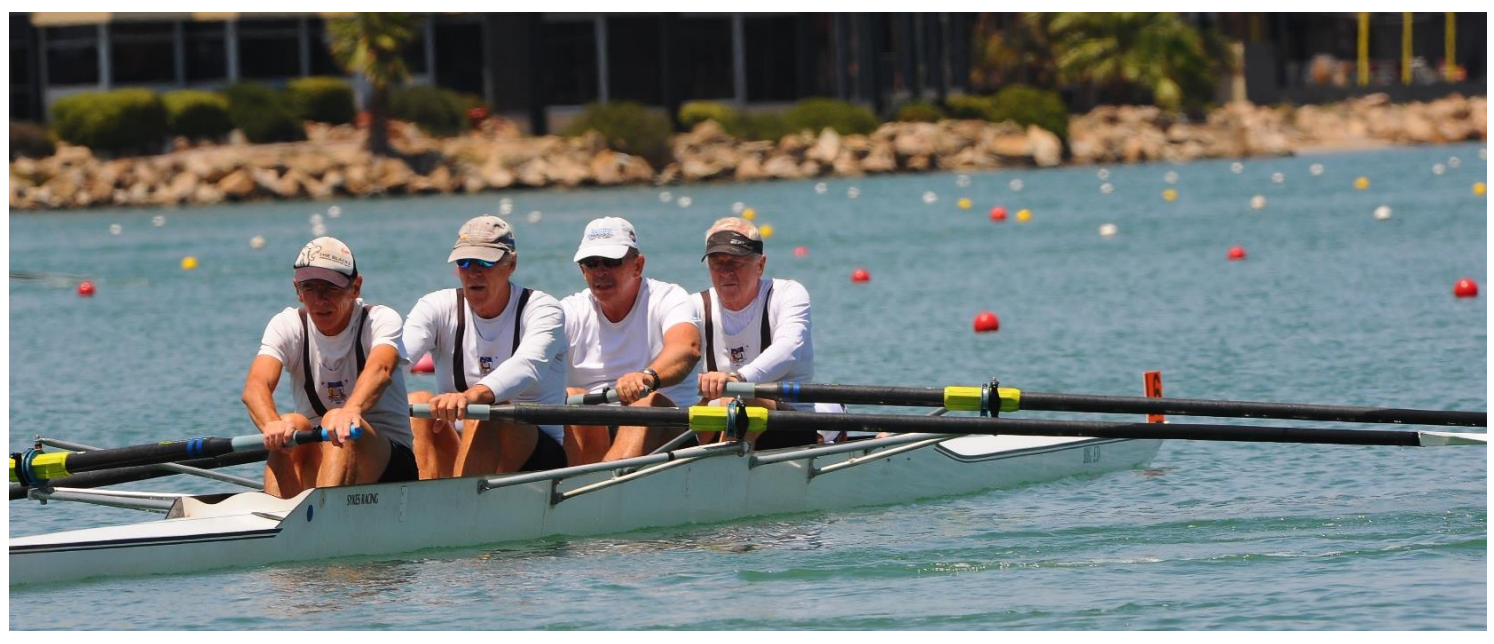
RRC Small Boat & Grade Regatta, Jan 2020