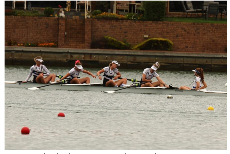
St Peters Girls School, SG4+, SA State Championships