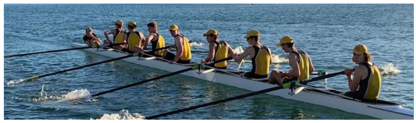
Scotch College SB 1st 8+, SA State Championships, 2020