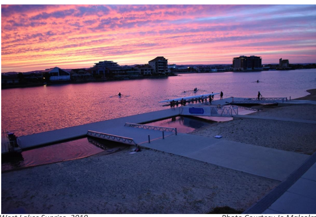
West Lakes Sunrise, 2019