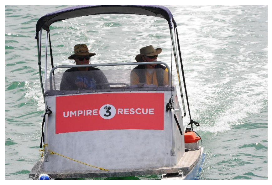
Umpire Boat, RTI Regatta, 2019

Umpires and Volunteers Subcommittee Chair August 2020