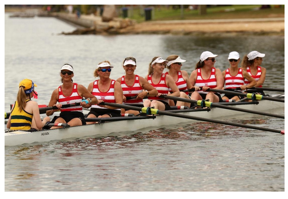
TRC W8+ SA State Championships

Chair – Rowing South Australia Inc. August 2020