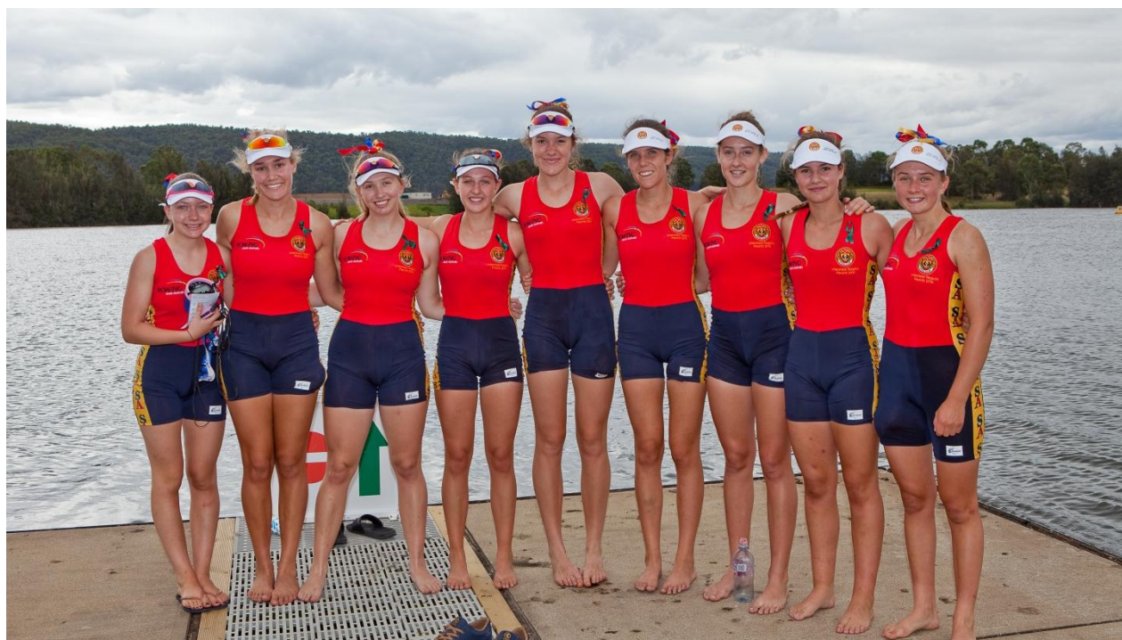
South Australian Women's Youth VIII (2016)