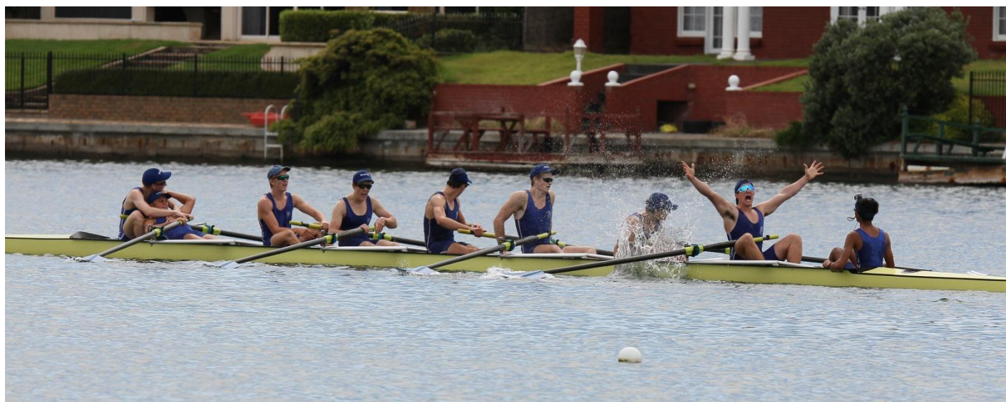
St Peter's College First VIII (2016)