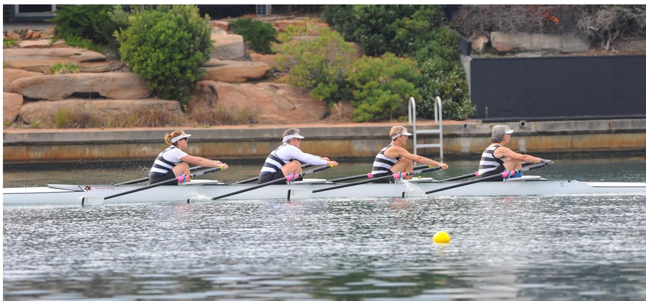
Port Adelaide Masters Women's 4x (2016)