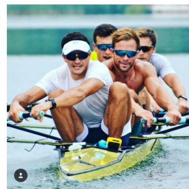
Australian Men's 4- (2016)

All the SASI athletes and coaches represented SA in the Interstate Regatta, with bronze medal success in the Kings Cup 8+.