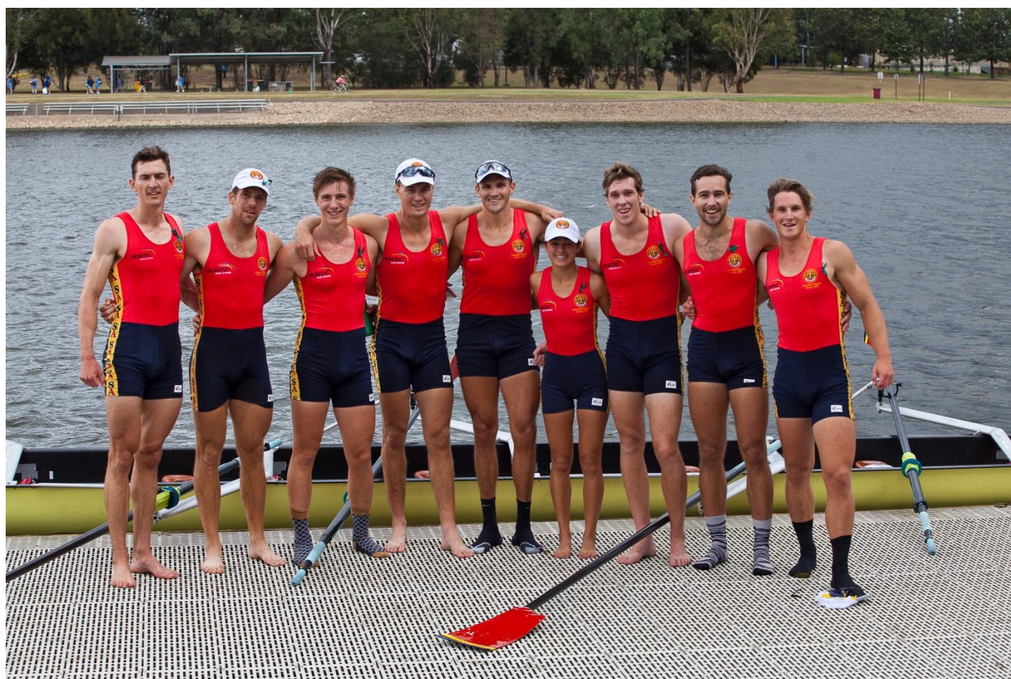
South Australian King's Cup Crew (2016)