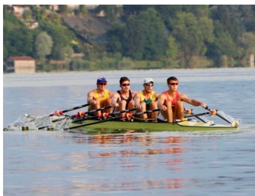
Australian Men's 4x (2016)