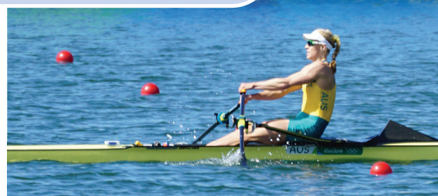
Kim Brennan won the single scull at Rio in 2016.

ISBN (hardback) limited edition: 978-1-876718-34-X ISBN (paperback) edition: 978-1-876718-35-0