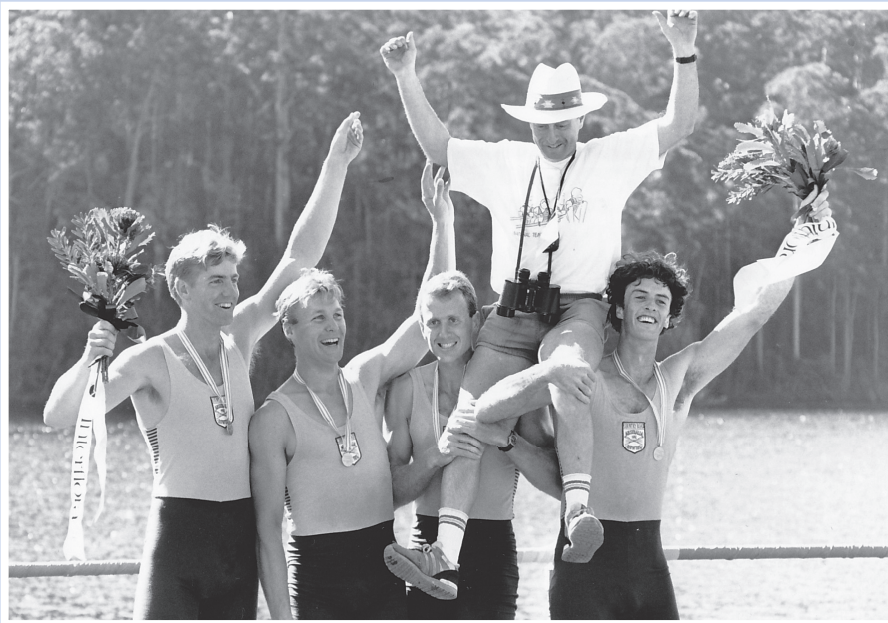
The original Oarsome Foursome became world champions at Lake Barrington in 1990.

competition. The members of the Oarsome Foursome, who first won gold at the 1990 World Championships, became household names. Peter Antonie and Stephen Hawkins, who won Olympic gold in the double sculls in 1992, also enhanced rowing's status.