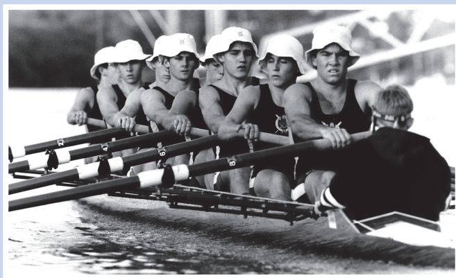
Brisbane Boys' College won the Brisbane head in 1993.

Australia achieved a remarkable decade of success in the 1990s, when it ranked among the top nations in international