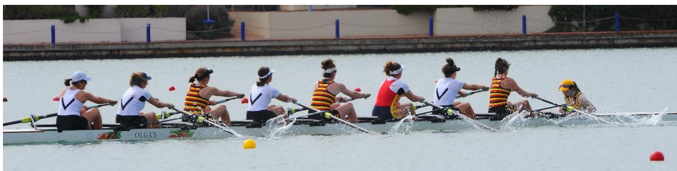
Women's Youth Eight Selection Trials, December 2019