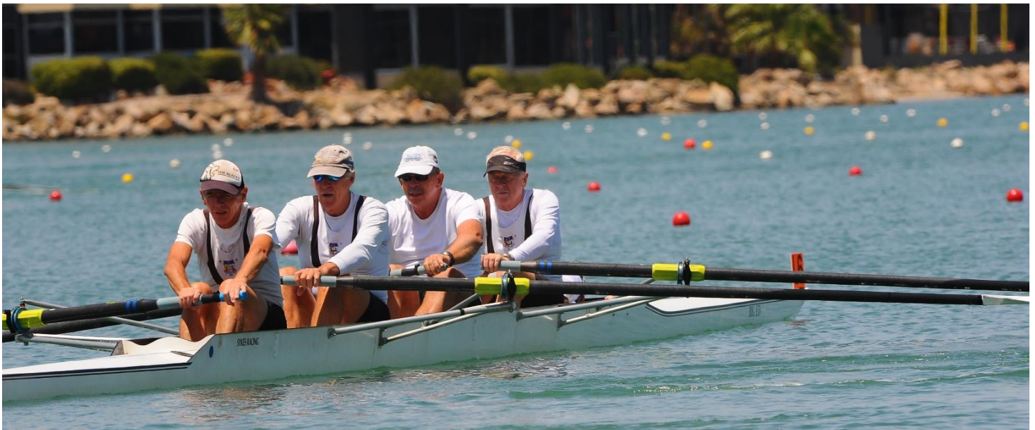
RRC Small Boat & Grade Regatta, Jan 2020