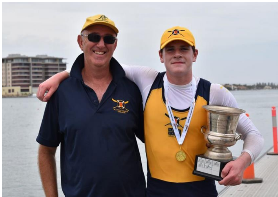
U17M1x medal presentation, SA State Championships, 2020