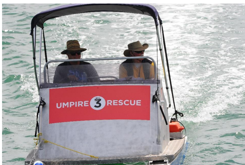
Umpire Boat, RTI Regatta, 2019

Umpires and Volunteers Subcommittee Chair August 2020