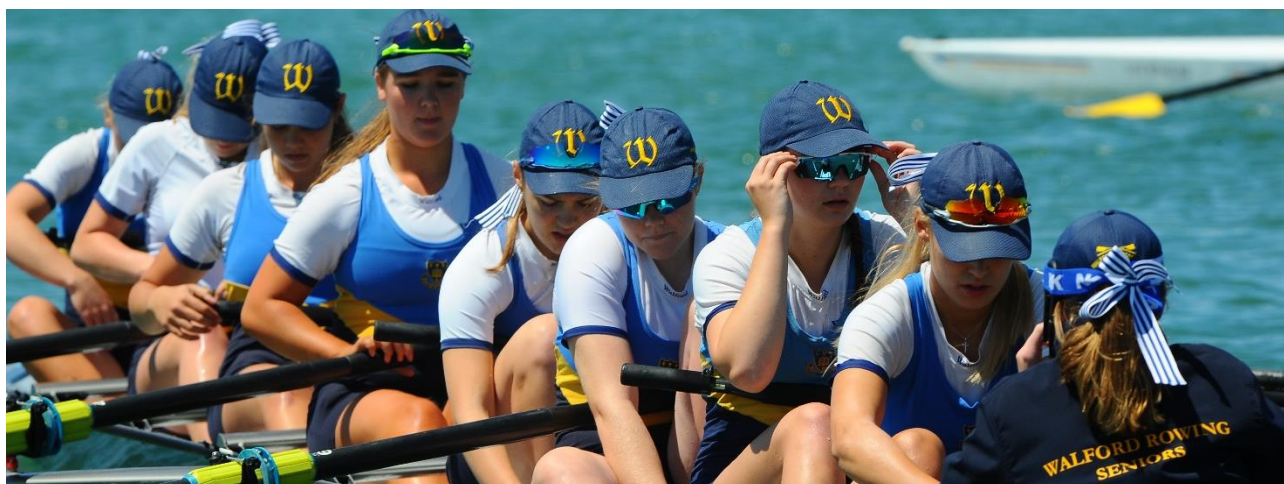
Walford SG8+, Scotch School Premiership Series Regatta, 2019