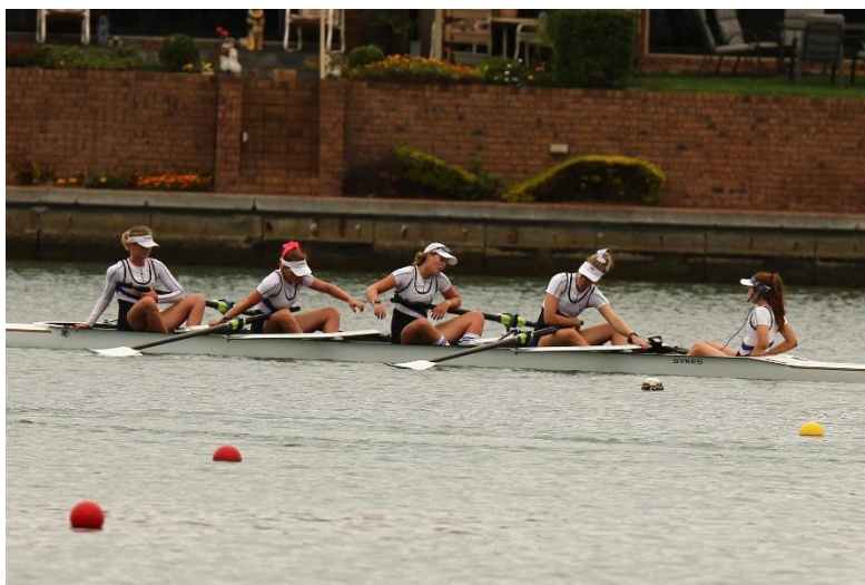
St Peter's Girls School, SG4+, SA State Championships