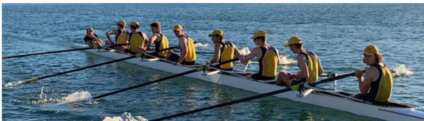
Scotch College SB 1 st 8+, SA State Championships, 2020