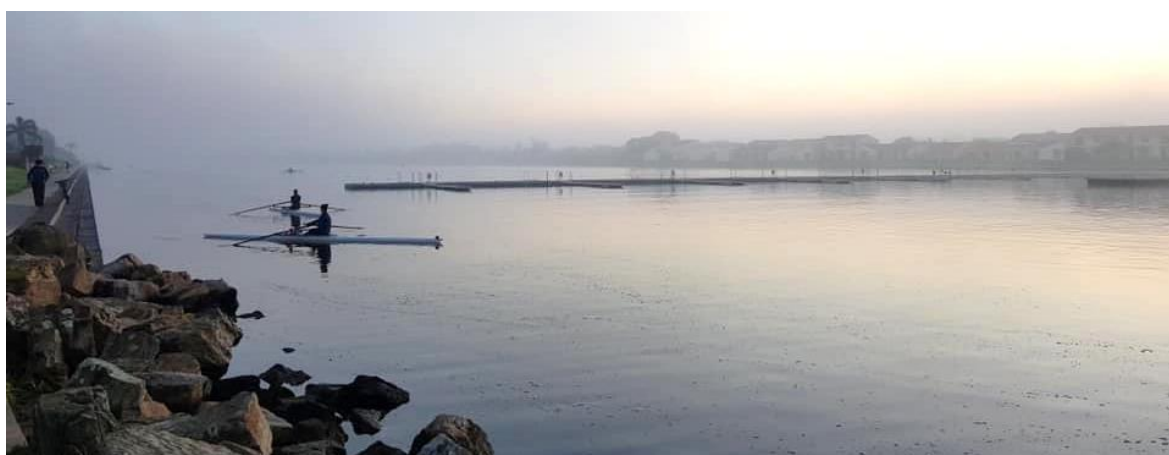
Winter Morning at West Lakes, 2020