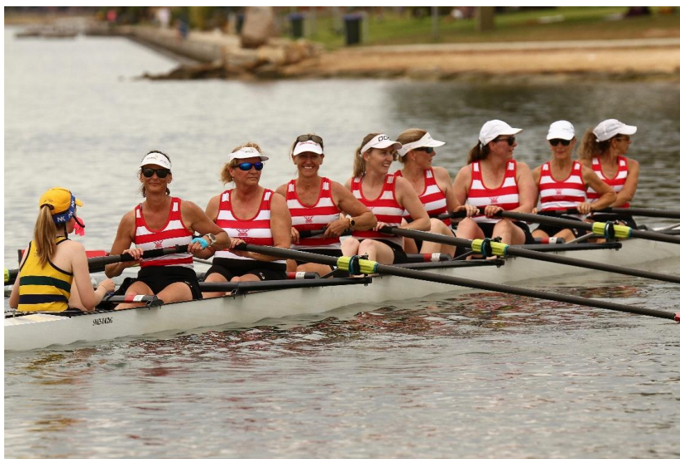
TRC W8+ SA State Championships

Chair – Rowing South Australia Inc. August 2020