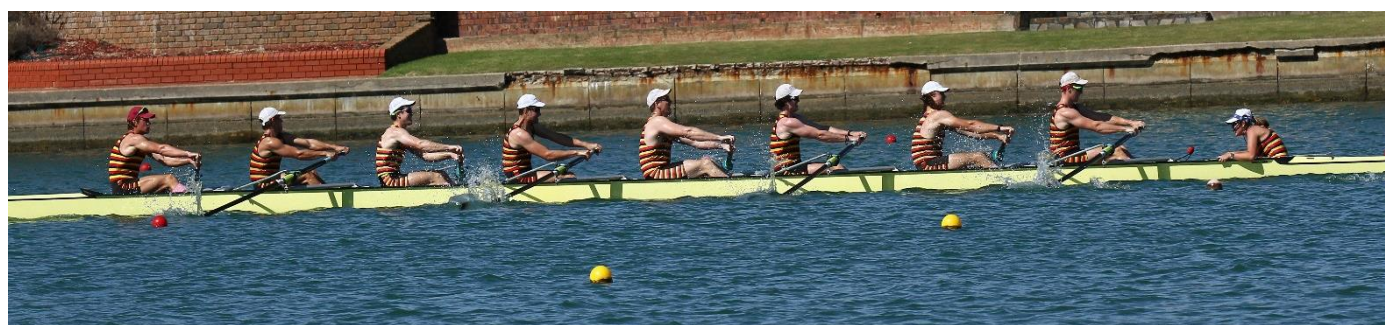
Open Men's Eight Winners, SA State Championships, 2020