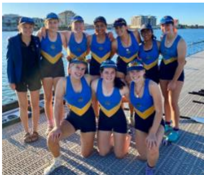
Walford 2 nd 8+, Champion Schoolgirl Crew 2020