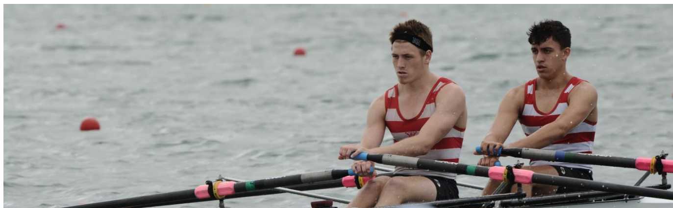
TRC OM2x, PAC West Lakes Regatta, 2020

Three of the four family members are involved in recreational rowing. Philip looks forward to building the strength of Rowing SA to support everyone participating in rowing in South Australia.