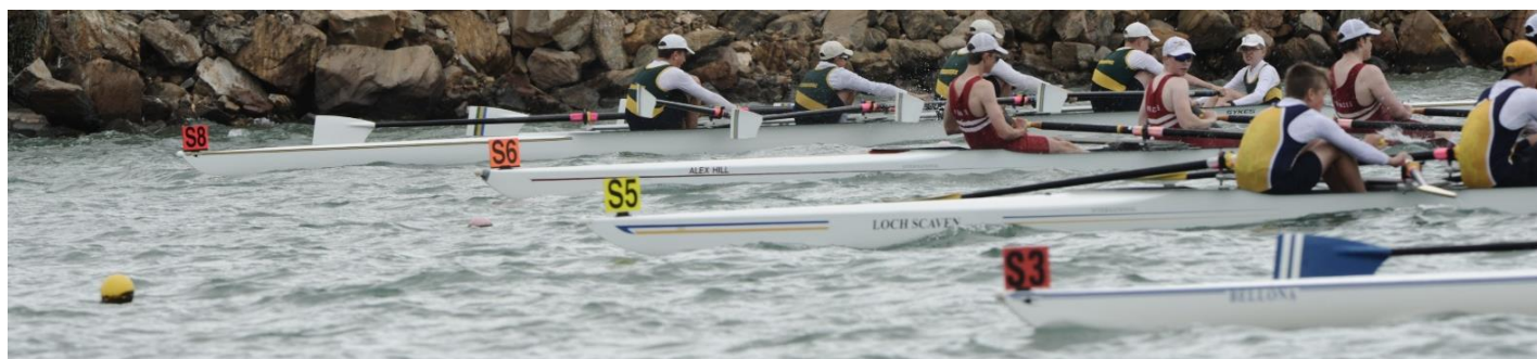
SB Yr 8/9 4x+ final, PAC West Lakes Regatta, 2020