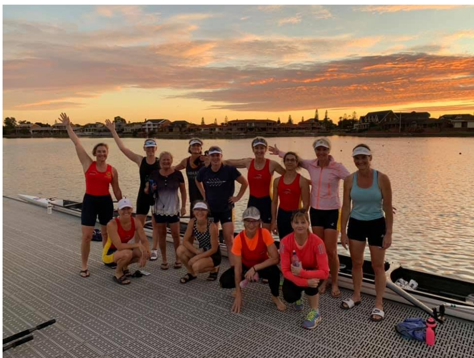
SA Masters W8+ training, 2020