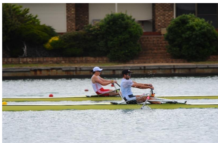
Kings Cup Small Boat Racing, SA Selection Trials, December 2019